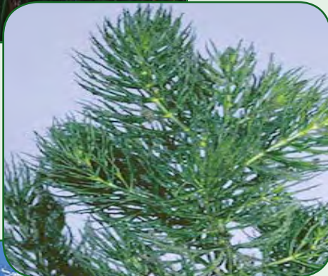
Coontail Ceratophyllum demersum