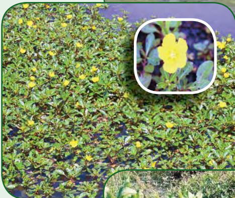
Water Primrose Ludwigia peploides