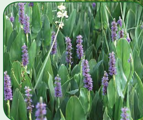
Pickerelweed Pontederia cordata