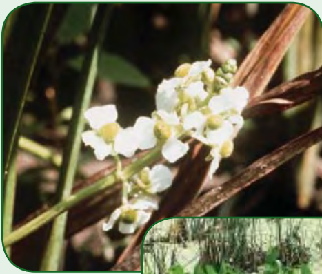
Delta Arrowhead Sagittaria platyphylla