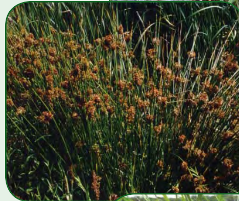
Soft Rush Juncus effusus