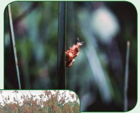
Olney's Bulrush Schoenoplectus americanus