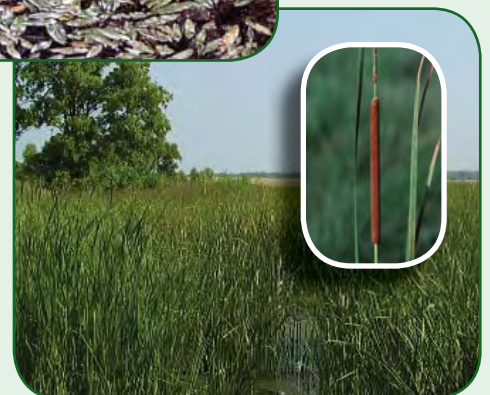
Southern Cattail Typha domingensis