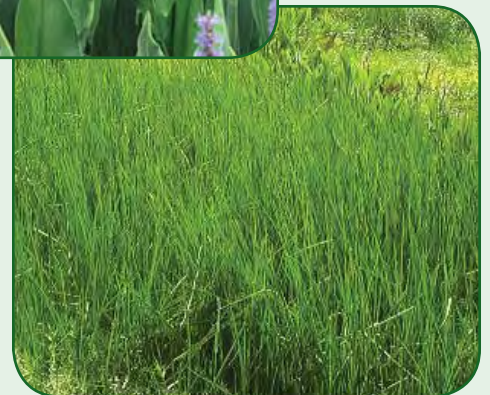
Squarestem Spikerush Eleocharis quadrangulata