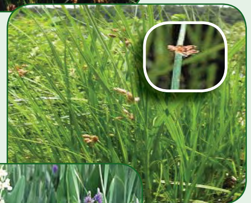
American Three Square Bulrush Schoenoplectus pungens