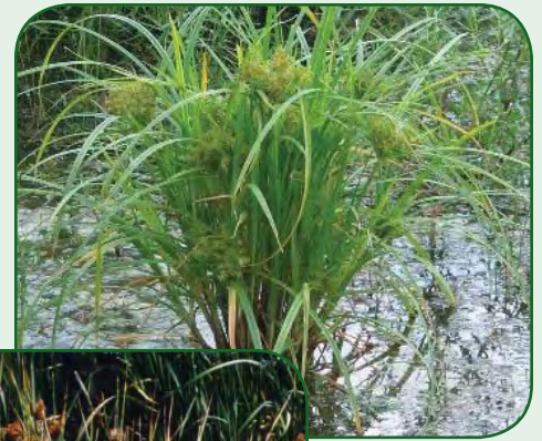
Flatsedges Cyperus spp.