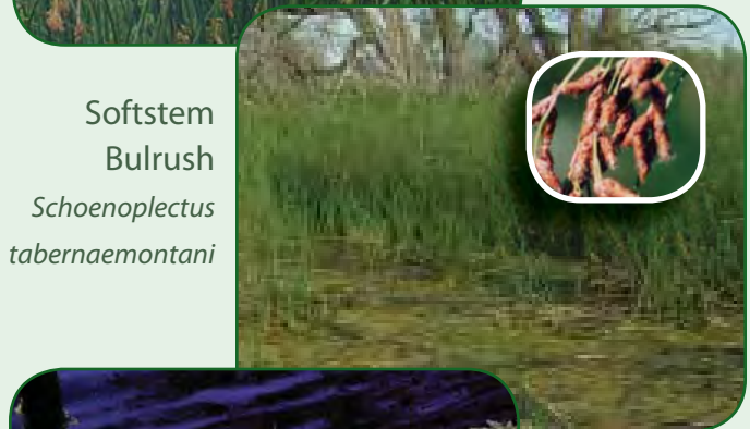
Softstem Bulrush Schoenoplectus tabernaemontani