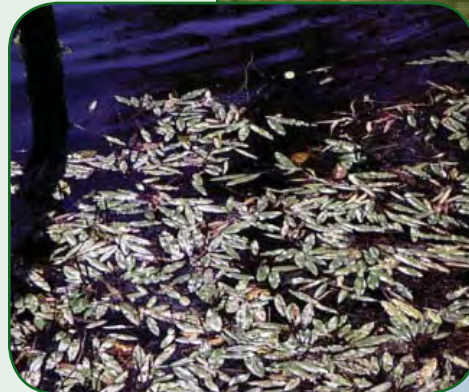
American Pondweed Potamogeton nodosus