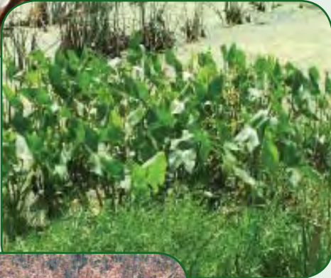
Duck Potato Arrowhead Sagittaria latifolia