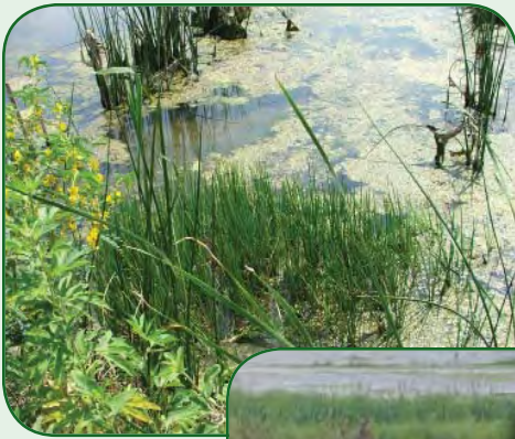
Spikerush Eleocharis spp.