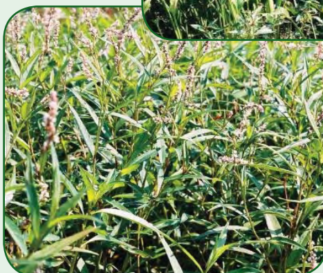
Swamp Smartweed Polygonum hydropiperoides