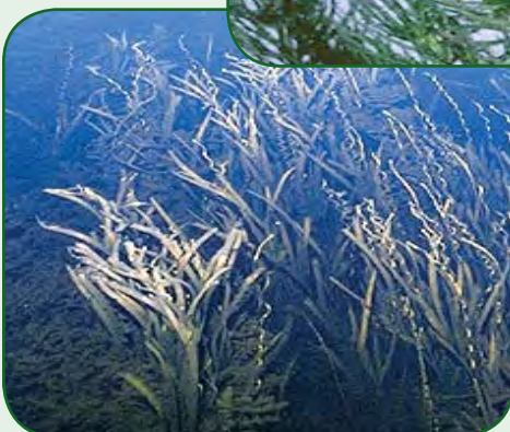
American Wild Celery Vallisneria americana