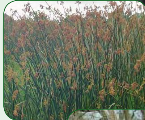
Hardstem Bulrush Schoenoplectus acutus