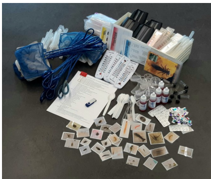
Example Wetland Ecology Trunk