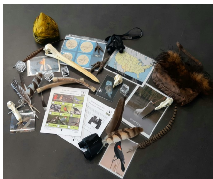
Example Bird Trunk